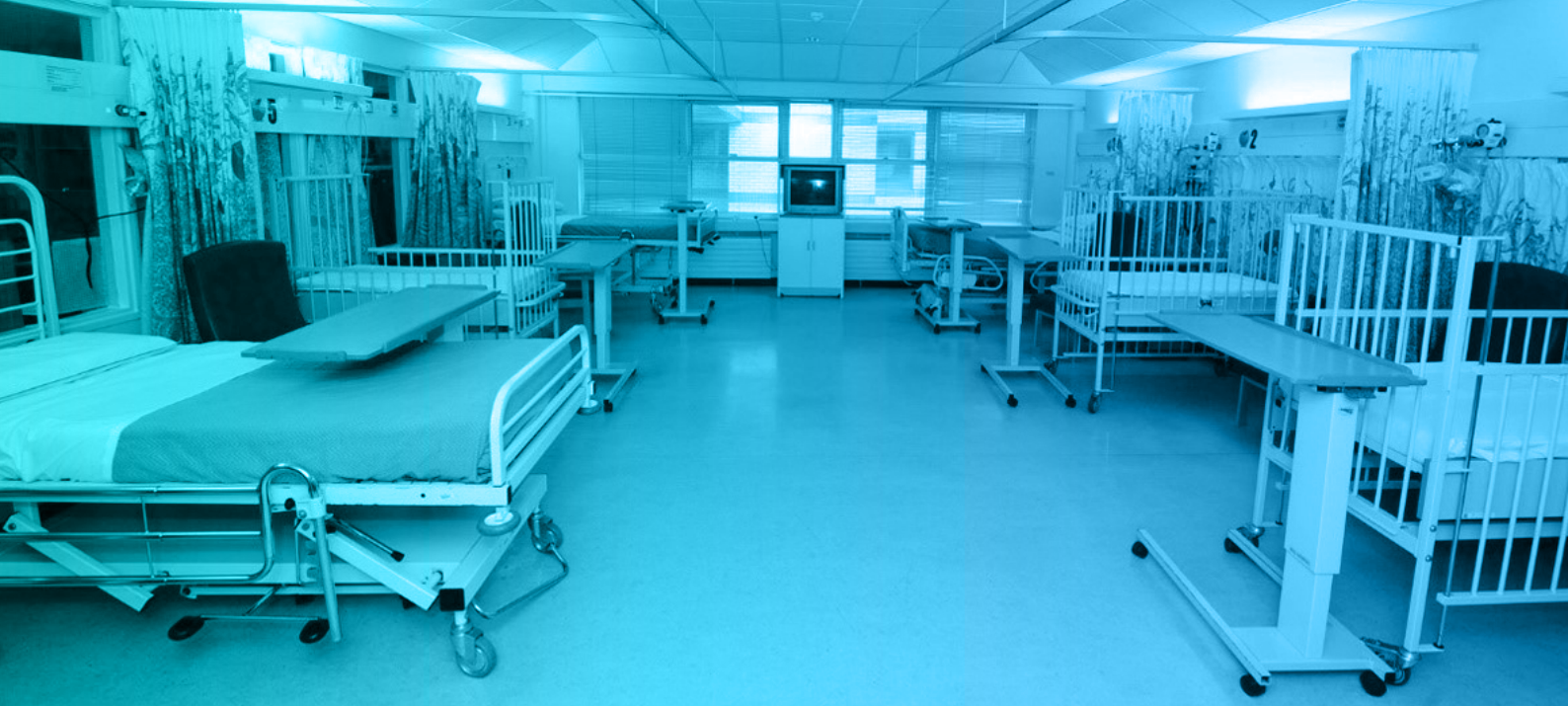
Malakia Maternity Hospital donated by Trinity Energy